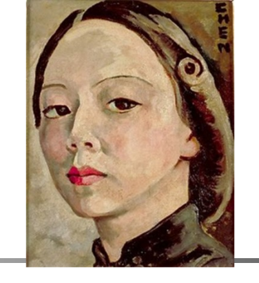
Why does the Artwork look as such?